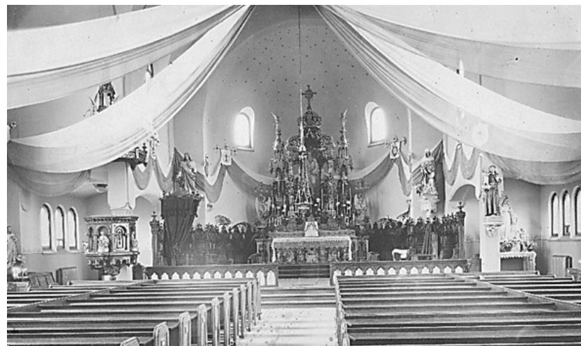
St. Paul's bedecked for its elevation to being the Cathedral for the newly erected Diocese of Saskatoon, April 1933