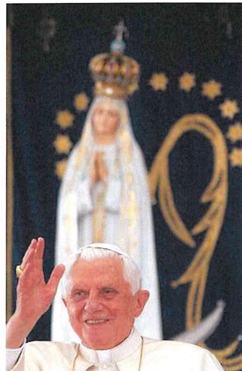
Pope Benedict XVI Born into Eternity December 31, 2022